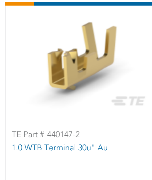
TE Part # 440147-2 1.0 WTB Terminal 30u" Au