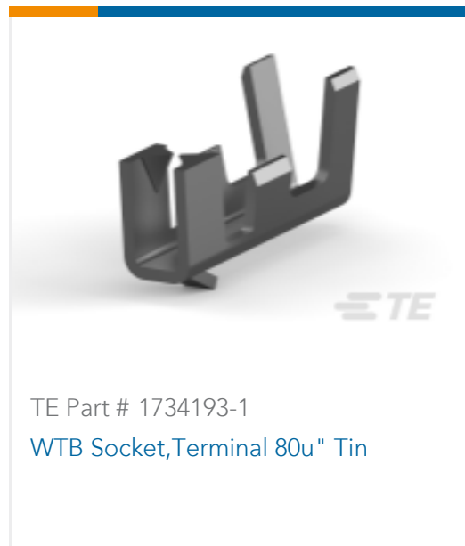
TE Part # 1734193-1 WTB Socket,Terminal 80u" Tin