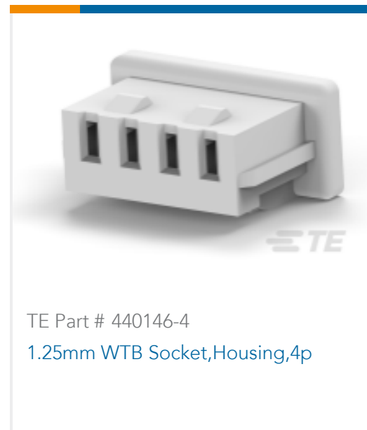
TE Part # 440146-4 1.25mm WTB Socket,Housing,4p